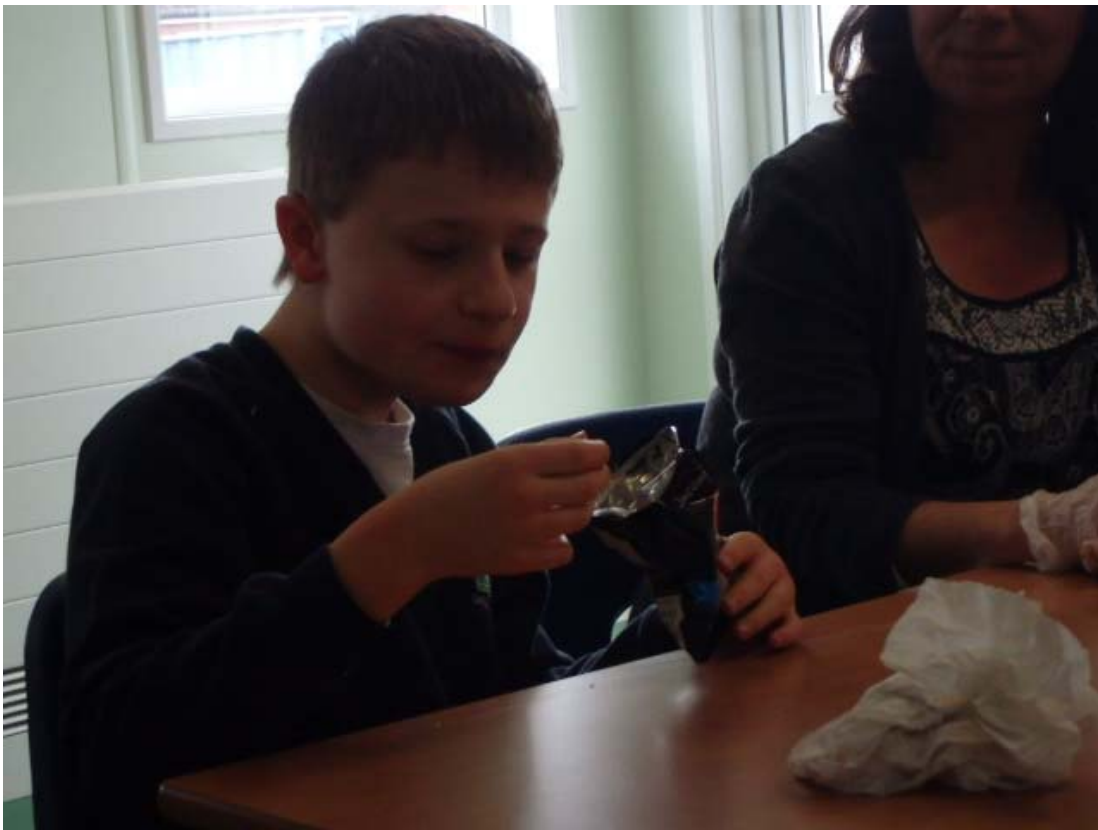
LEARNING TO HOLD A CRISP PACKET AND EAT ONE AT A TIME FROM THE PACKET. WELL DONE!