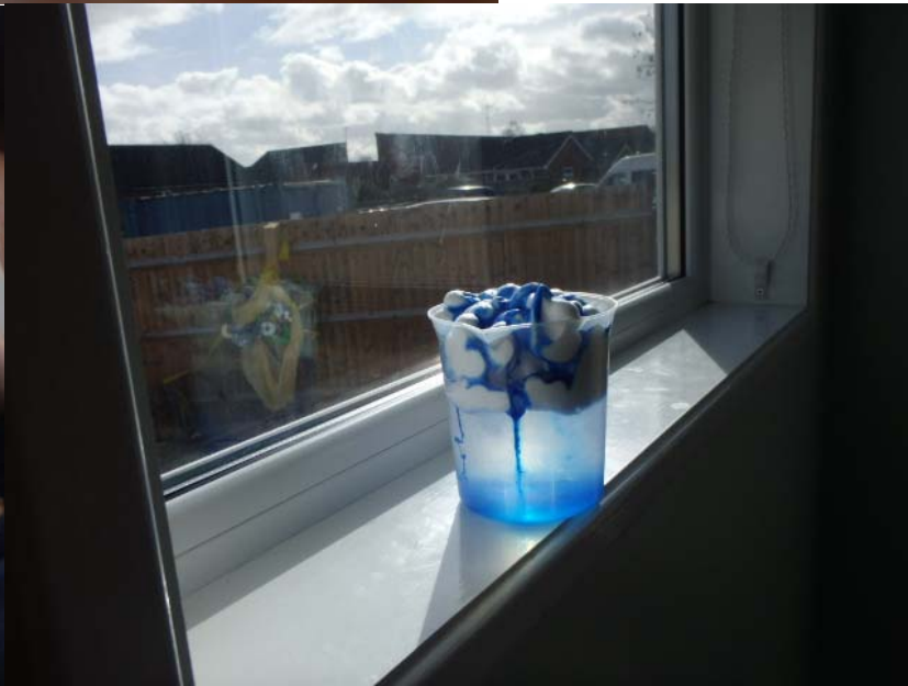
A RAIN EXPERIMENT AND EXPLORA- TION OF FOAM, WATER AND COLOUR. (ATTENTION AUTISM—SCIENCE)