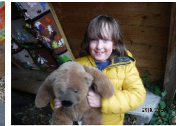
to find . . . . . the bear!